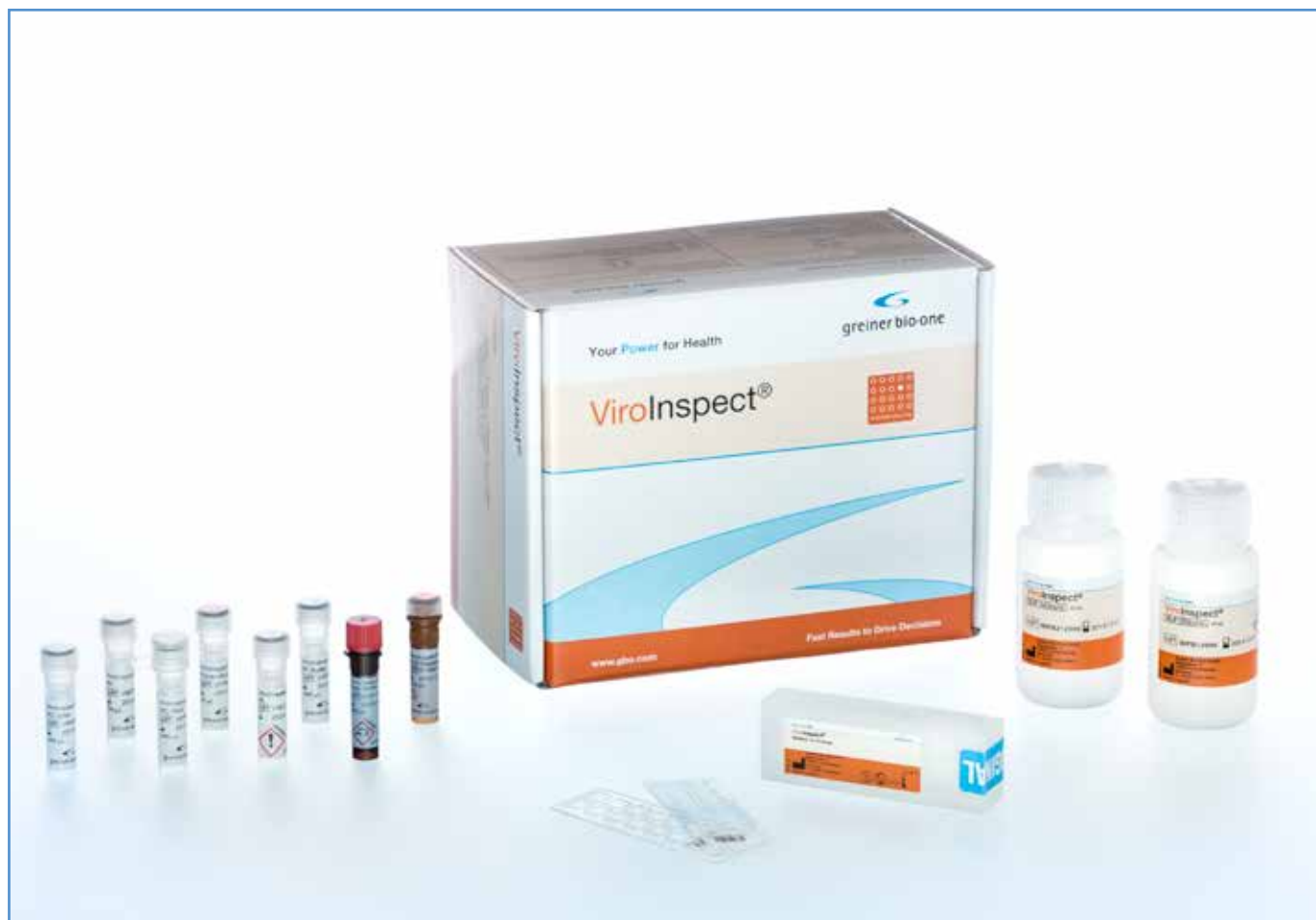
Figure 3: ViroInspect® Kit content